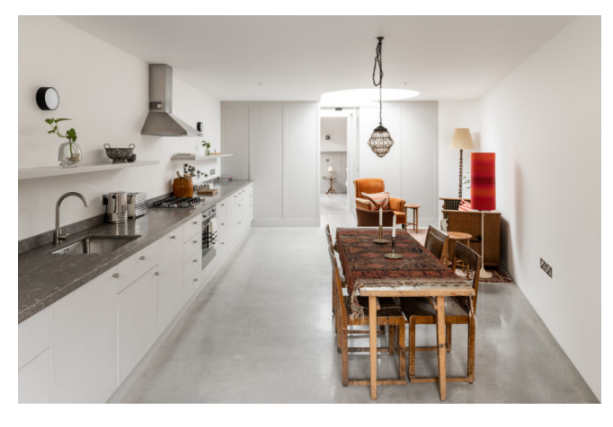
London, North London £625,000 Freehold